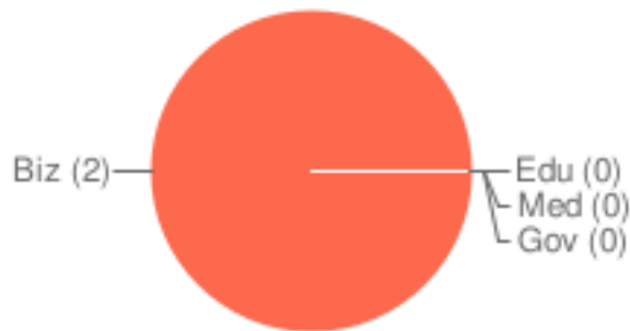
Incidents By Sector