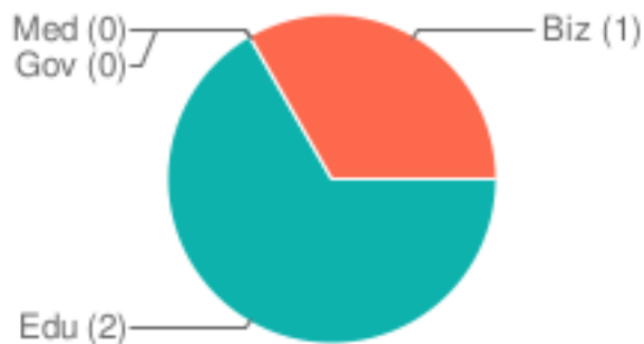
Incidents By Sector