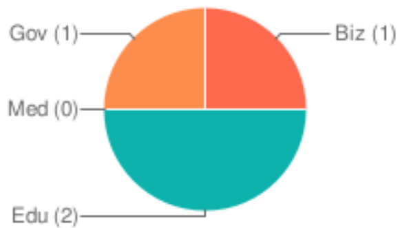
Incidents By Sector