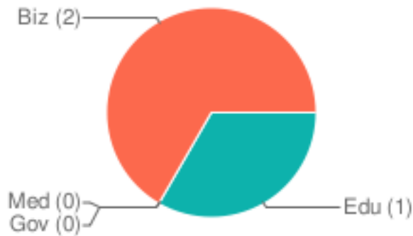
Incidents By Sector