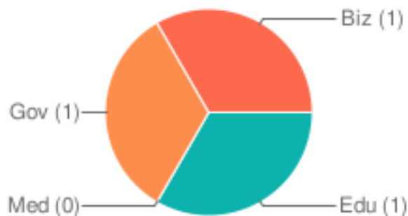
Incidents By Sector