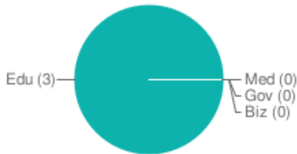
Incidents By Sector