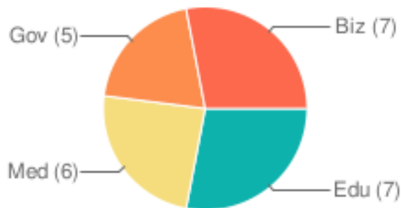
Incidents By Sector